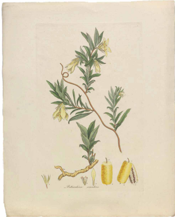
Billardiera scandens. James Edward Smith. A Specimen of the Botany of New Holland. Engraved by James Sowerby. London: J. Davis, 1794

Botanist Jacques-Julien Houtou de Labillardière published his impressive work of the Australian flora, this showed a peak of scientific occupation with exotic plants, and it demonstrated that, in fact, “Paris [had become] the center of botanical development” (Williams 2001: 1).