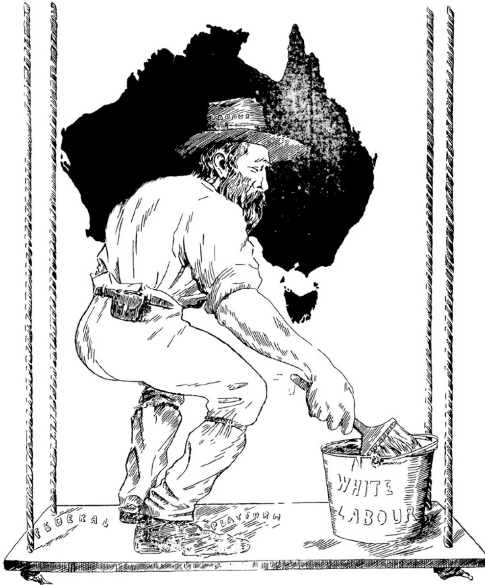
Fig. 3: "A White Australia" Cover of The Worker , 27.1.1900