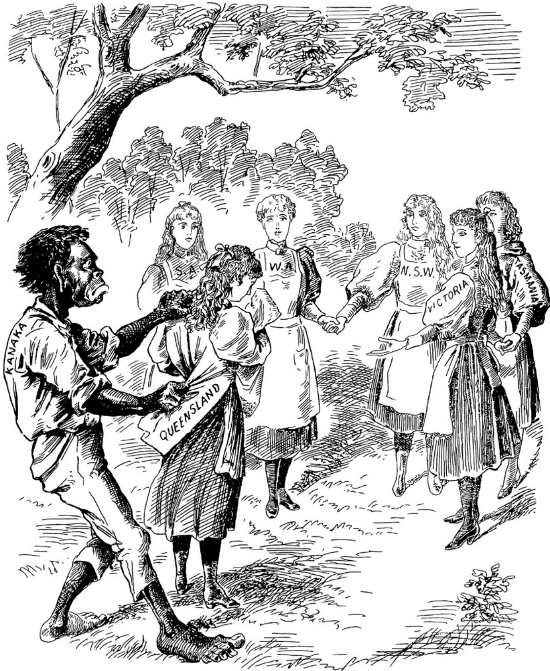
Fig. 1. “The real reason why Queensland was not allowed to take part in the Federal Convention”, Cover of The Worker , 24.7.1897

The cover of the labour movement’s magazine The Worker (1897) shows a cartoon with the caption “The real reason why Queensland was not allowed to take part in the Federal Convention” (Fig. 1). It depicts the anthropomorphized and feminized