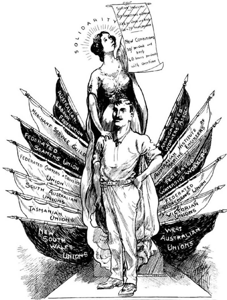
Fig. 4: “Strength United is Stronger” Cover of The Worker , 19.8.1911

editorial article, the victorious resistance against the “bitter servitude” associated with the “sweetening product” is taken as proof for a politically organized “spirit of mateship” ( The Worker 1911: 6).