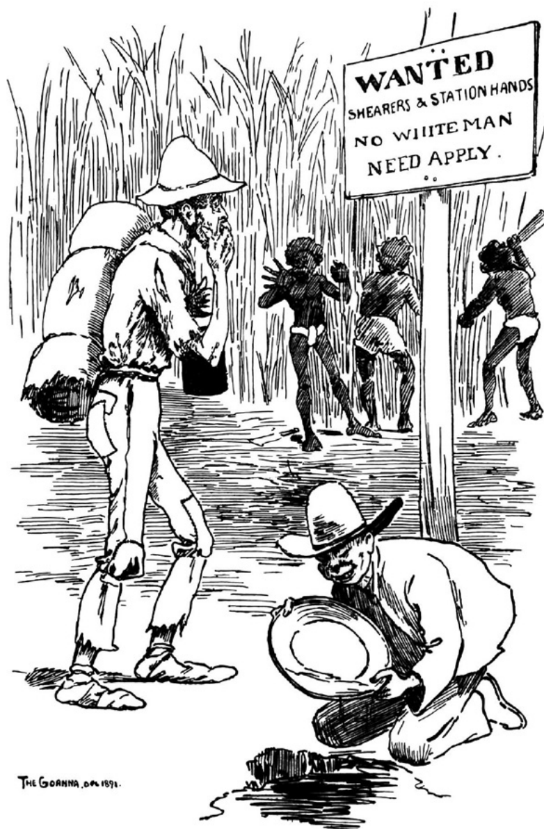
Fig. 2: “The Bushman’s Future” Cover of The Worker , 14.5.1892

Politically, this found expression in the Labor Party’s propaganda. Here, for instance in “A White Australia”, another cover cartoon by The Worker (1900, Fig. 3), at a time when the Party made the “racial purification” of Australia part of their programme. Standing on a plank labelled “federal platform”, the “white worker” is about to cleanse Australia using “white labour”. That its whiteness has to emanate from Queensland (i.e., the “whitening” of the sugar industry) is emphasized by the already shining north-eastern area of the depicted continent.